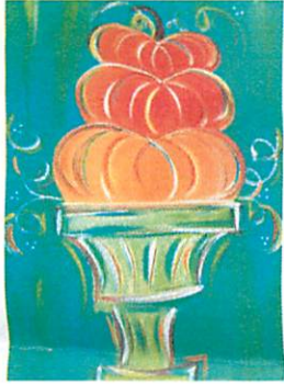
Route 66 Redbud 9./21: 6-9:00 pm $35